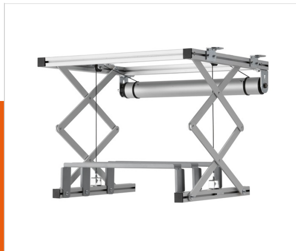
PPL 2035 PPL 2035-120V